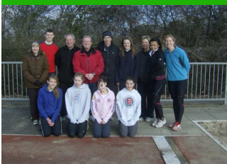
Coach and Athlete Development Day, Ipswich